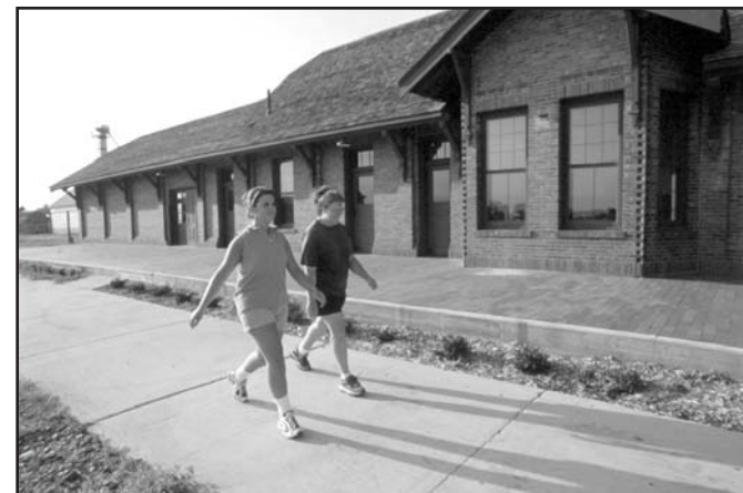
Trail users pass the O'Neill Depot Trailhead.